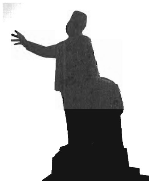
Nasser reaches out to his people

Sadat's new economic orientation was known as the infitah . In retrospect, his policies brought inflation, high prices, American influence, quickly rising foreign debts, a culture of vulgar profiteering, a society that consumed more than it produced, and excluded the poorer classes. Western investors—given privileged status and incentives by the Egyptian government in the hope of attracting large amounts of foreign capital for development—in fact did little to develop the industrial or agricultural infrastructure. Instead, they focussed their