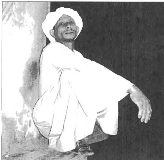
Listening to the Friday sermon

The Muslim Brothers reached the apex of their power following World War II. The increased economic and social pressures that the war placed on an already hurting society sent many adherents their way. During the late 1940s, the Brotherhood itself became increasingly frustrated both by the denial of