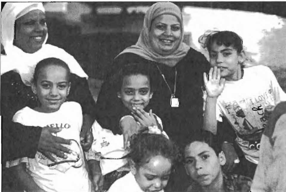
The many faces of fundamentalism

Muslim groups have often taken clearly defined actions to mitigate widespread hardships and bring services and aid to sections of the populace that the ineffectual and cumbersome bureaucracy cannot reach. Through the philanthropic infrastructure of the mosques, they have set up relief organizations,