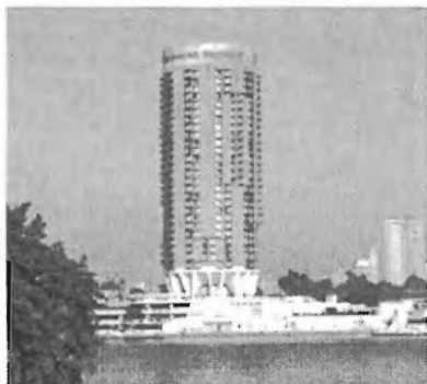
One of the fundamentalists' hated Western hotels, in Cairo

who was the celebrated assassin of Sadat in October, 1981. His words, “I am Khalid al-Islambuli, I have killed Pharaoh, and I do not fear death,” were recorded and broadcast throughout the Islamic world. For many, this sentence represented a relief to finally be rid of Sadat. For others, it was call to battle, the echo of which has yet to fade.